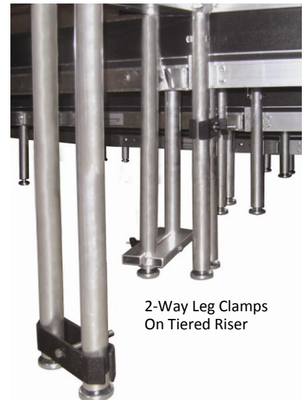
2-Way Leg Clamps On Tiered Riser