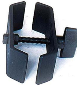
2-Way Leg Clamp