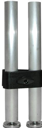
2-Way Leg Clamp With Fixed Height Legs