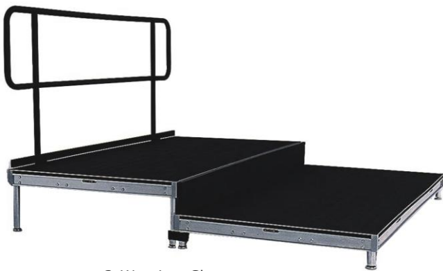
2-Way Leg Clamps on Tiered Riser