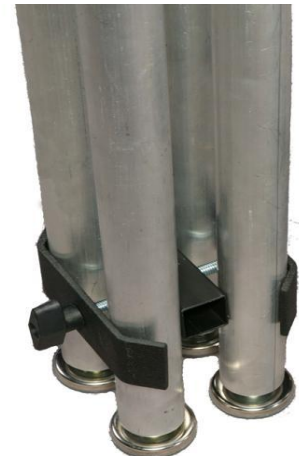
4-Way Leg Clamp With Fixed Height Legs