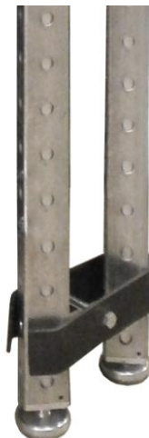
2-Way Leg Clamp With Adjustable Height Legs