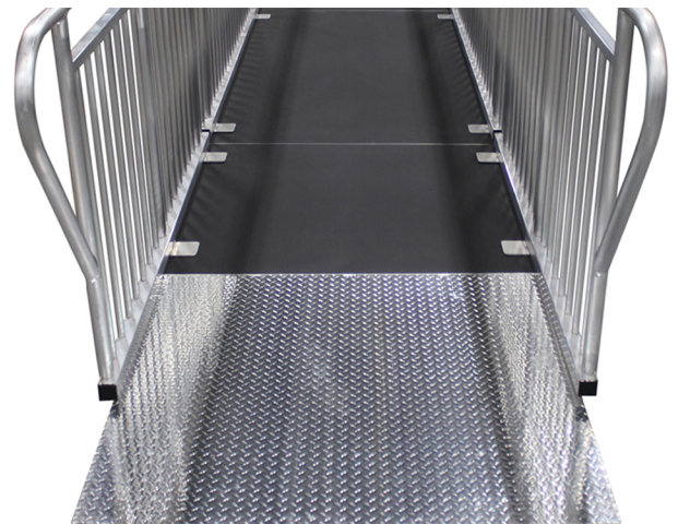
4' x 4' Diamond Plate Starter Ramp - Front View