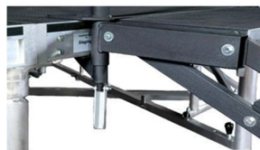
Stair Attached To Stage With Clamp And All Thread Handle