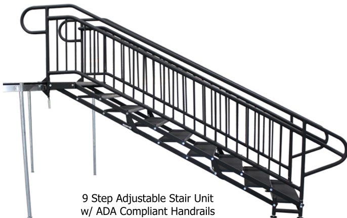
9 Step Adjustable Stair Unit w/ ADA Compliant Handrails