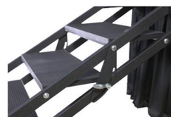
Rise Adjustment Handle