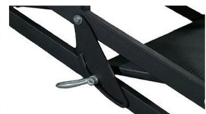
Close Up Of Rise Adjustment Handle