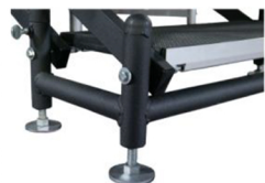
Stair Base With Leveling Foot Pads