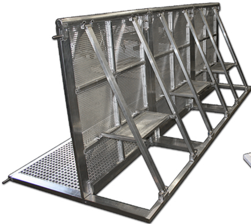
Crowd Control Barricade