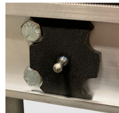
Male Stud Receiver