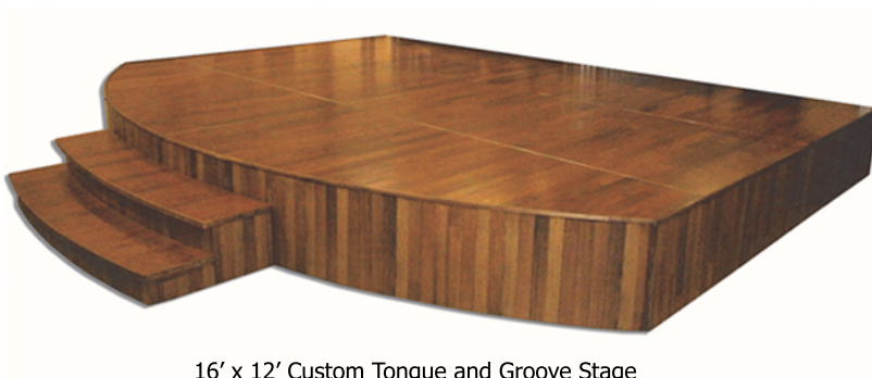
16' x 12' Custom Tongue and Groove Stage With Curved Thrust