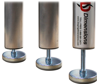
Non-Marring Neoprene Foot Pad w/ 2 1/2 inches of Fine Adjustment