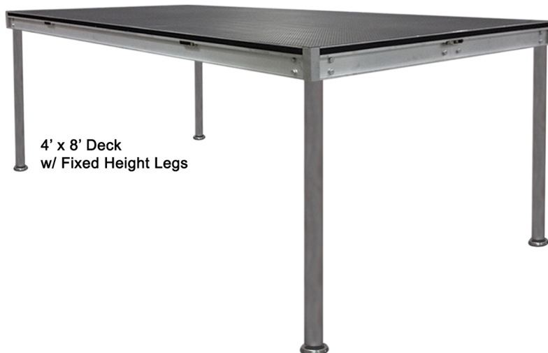
4' x 8' Deck w/ Fixed Height Legs