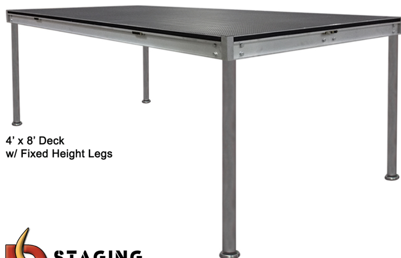
4' x 8' Deck w/ Fixed Height Legs