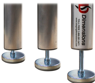
Non-Marring Neoprene Foot Pad w/ 2 inches of Fine Adjustment