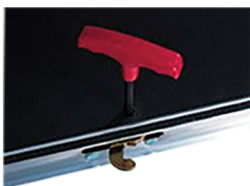
Male Dual Lock