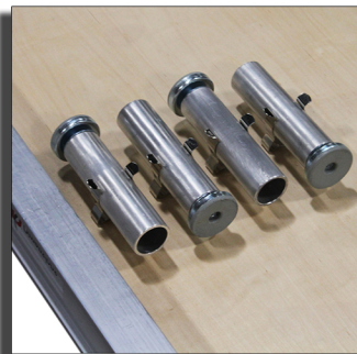
Fixed height legs mounted to the underside of a stage deck