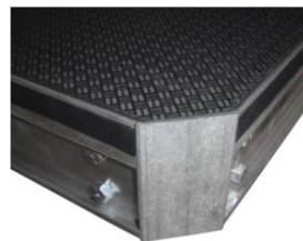
45 Degree Corner