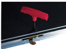
Male Dual Lock