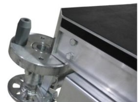
Close Up of Corner with Rosette on Layher Scaff System