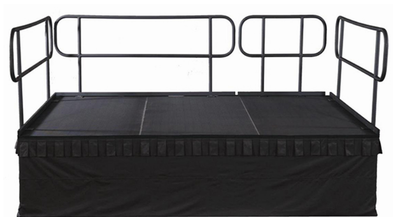
Adjustable Height Wyndham Stage Skirting