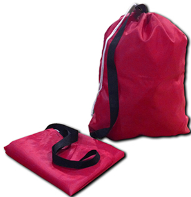
Stage Skirting Storage Bags