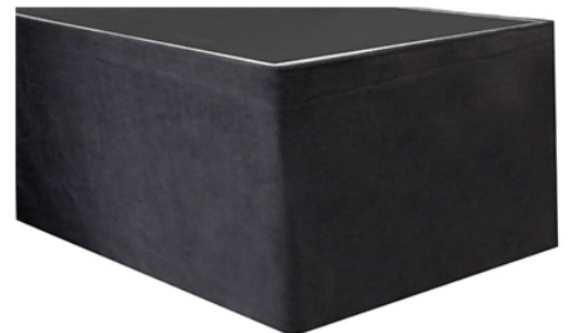
Flat Velour Stage Skirting