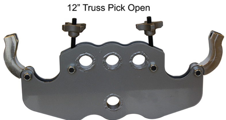
12" Truss Pick Open