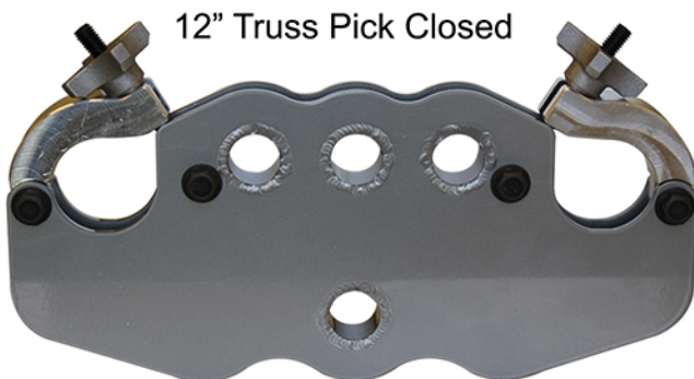
12" Truss Pick Closed