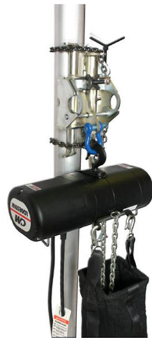
Quick Clamp with 1/4 Ton Motor