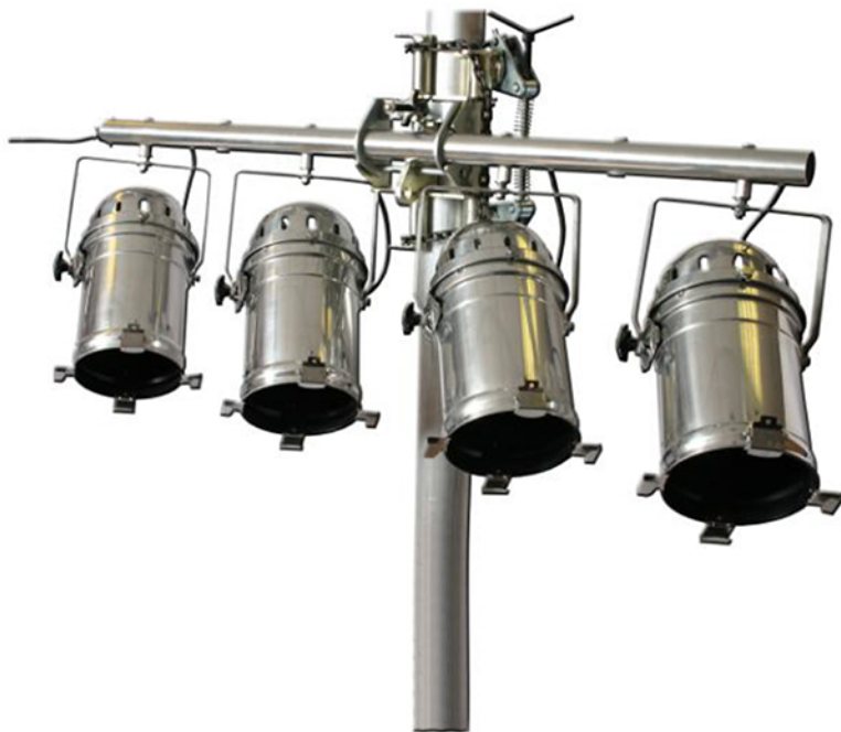
Quick Clamp with Lamp Bar