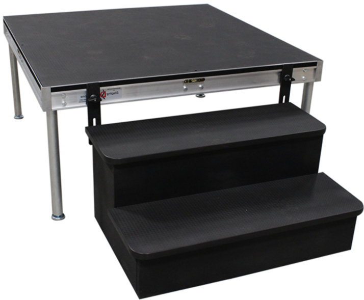
2 Step Stair Box - Non Skid Surface Attached to Stage Deck