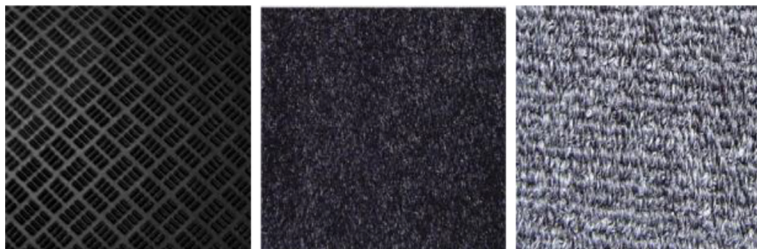
Non Skid Quad