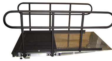
Side Mount Guardrail System