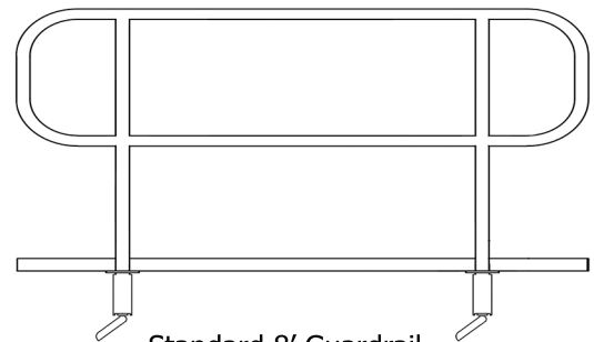
Standard 8' Guardrail