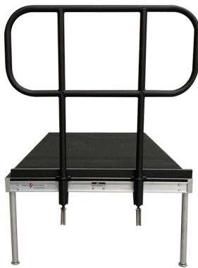
Standard 4' Guardrail