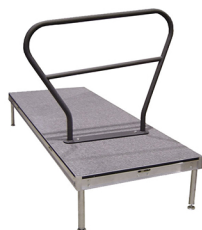
Custom Guardrail with Thru Deck Receivers