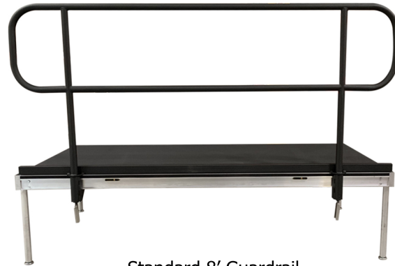
Standard 8' Guardrail