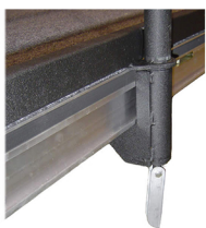
Guardrail Clamp Installed with All Thread Handle