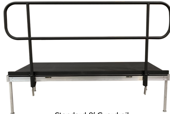
Standard 8' Guardrail