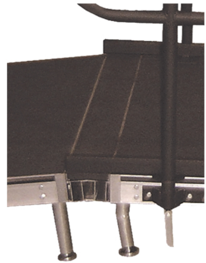
Transition Wedge-Side View