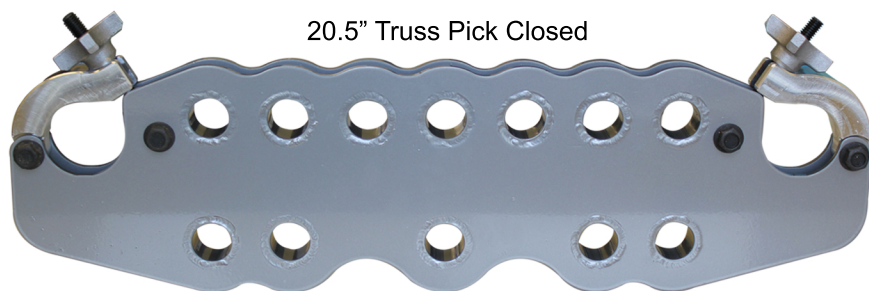
20.5" Truss Pick Closed